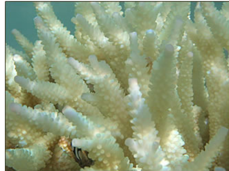
An image of coral that has lost its color due to coral bleaching.

Continuous global warming is ultimately going to lead to much devastation on Earth. When it comes to plants and animals, their survival will not be easy. Their natural habitats will change, making it hard for them to adapt. Not only will plants and animals on land suffer consequences, but those plants and animals of the oceans will