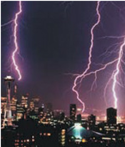
This image, taken from National Geographic, shows a severe lightning storm. If Global Warming continues down the path it is now, storms humans will face will much more intense than this.